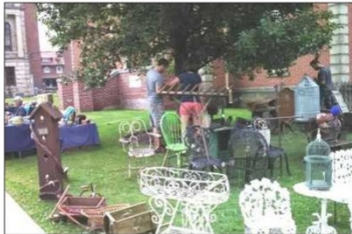
The courthouse lawn in Millersburg will become a haven for unique items and other antique collectibles this Saturday as Millersburg celebrates Antiques in the Alley.