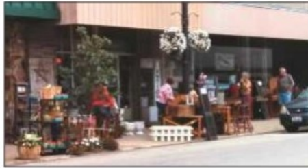
Historic Downtown Millersburg will become a mecca for antique hunters and other rare objects this Saturday from 9 a.m. to 5 p.m. as the village hosts Antiques in the Alley.